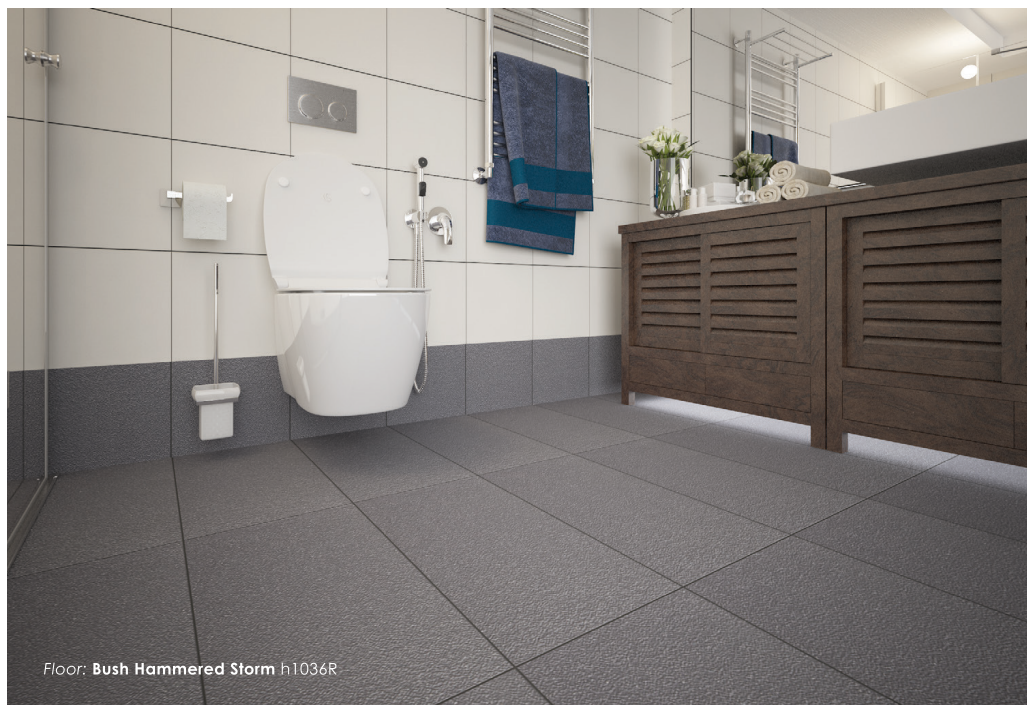
Floor: Bush Hammered Storm h1036R